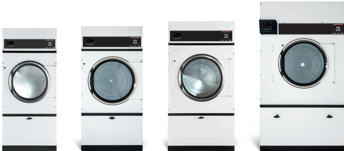
T-30 30 lb (13.6 kg)