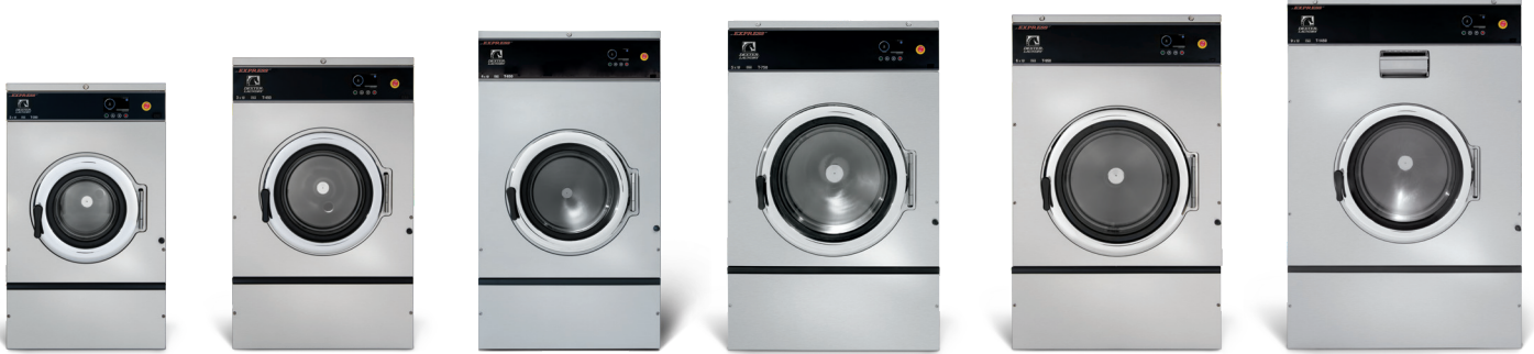
T-350 20 lb (9.1 kg)