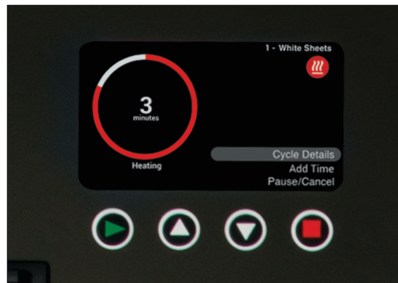
O-SERIES DRYER CONTROL