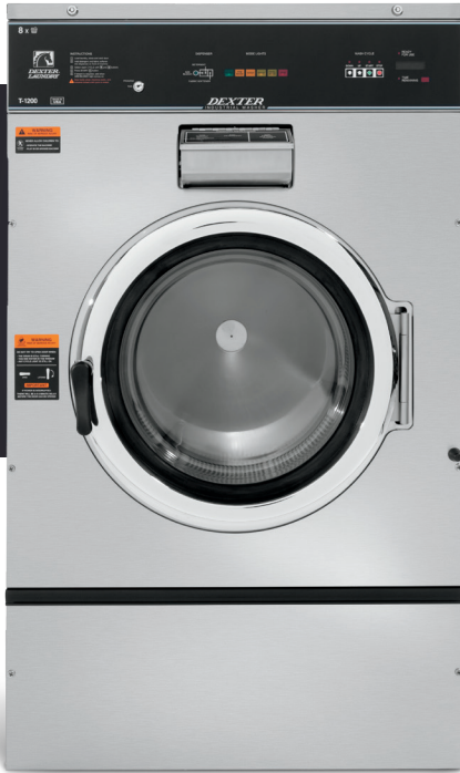
6 Cycle Control