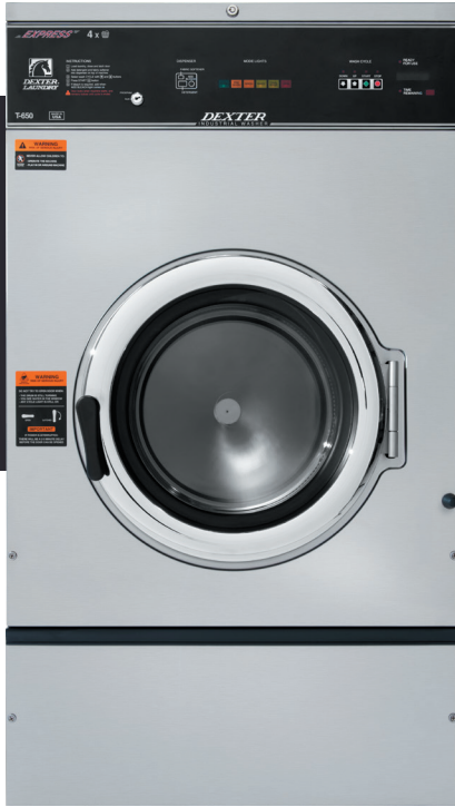
6 Cycle Control