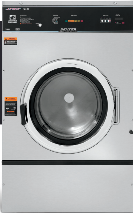
6 Cycle Control