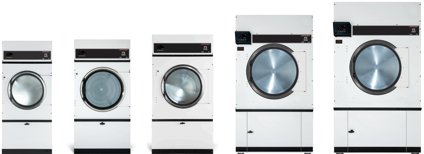
T-30 30 lb (13.6 kg)