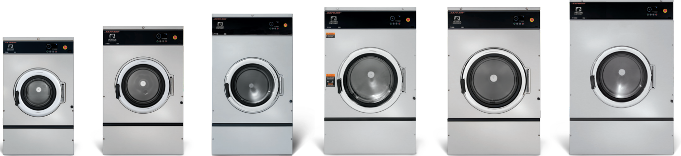
T-350 20 lb (9.1 kg)