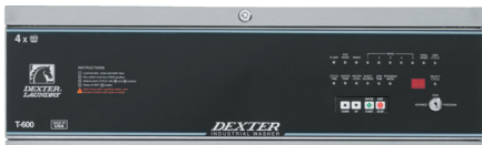
30 Cycle Control