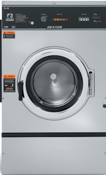
6 Cycle Control